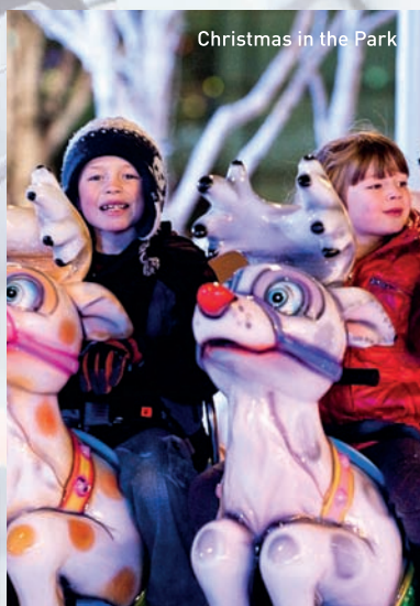
Christmas in the Park